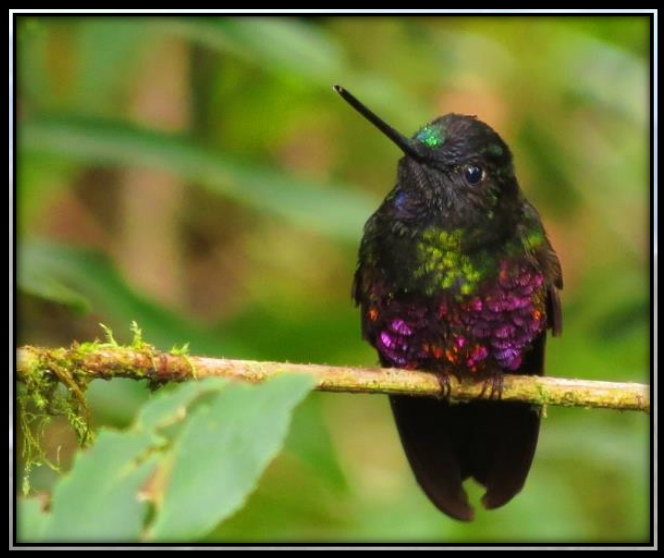
Near endemic, Blue-throated Starfrontlet