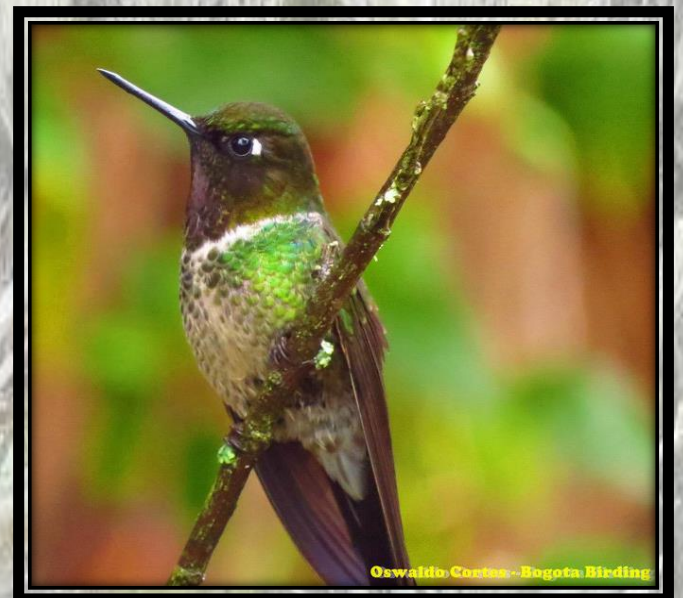
Amethyst-throated Sunangel