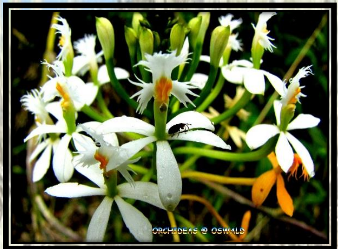
Elongated Epidendrum

THANK YOU FOR PLACING YOUR TRUST IN US BOGOTÁ BIRDING AND BIRDWATCHING COLOMBIA TOURS