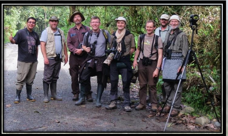
GUASCA – ANDEAN CLOUD FOREST