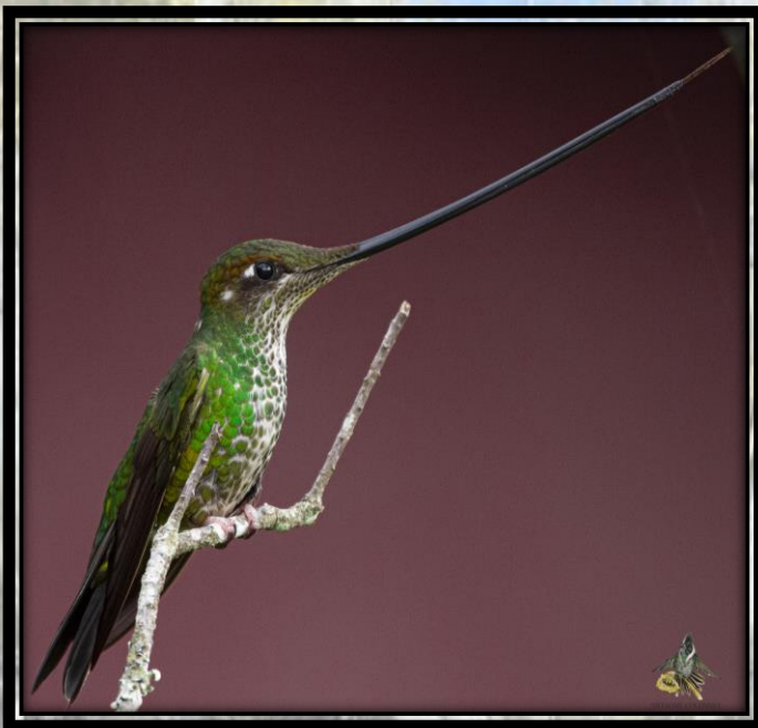
Sword-billed Hummingbird