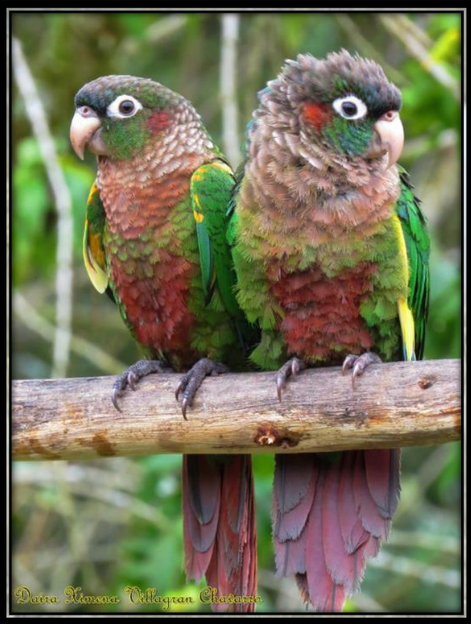
Flame-Winged Parakeet