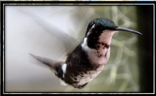
White-bellied woodstar