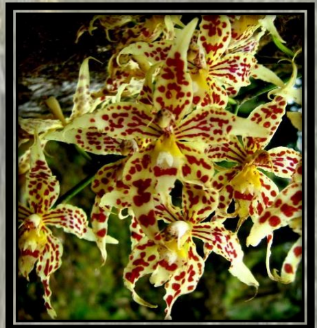
Glorious Odontoglossum – Endemic