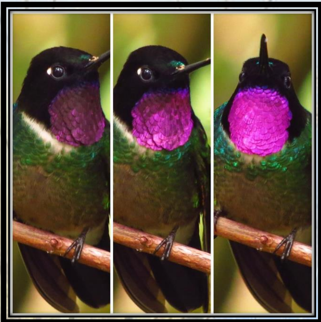
Amethyst-throated Sunangel