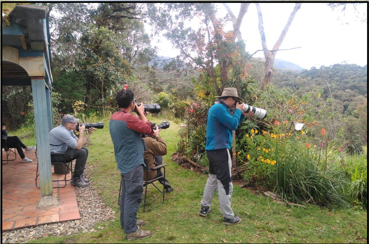
Birding tours

Colombia is the country with the big number of birds of the world with approximately 1921 species including endemic, near endemic, migratory and permanent residents. Colombia's wide variety of ecosystems and habitats make it a megadiverse country in fauna and flora.