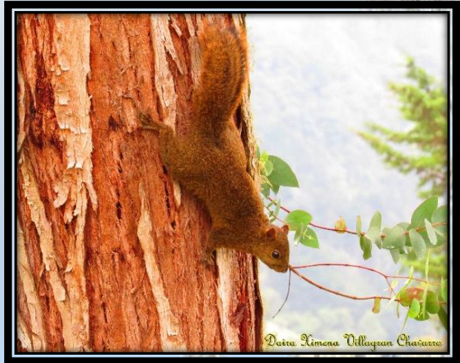
Red-tailed Squirrel