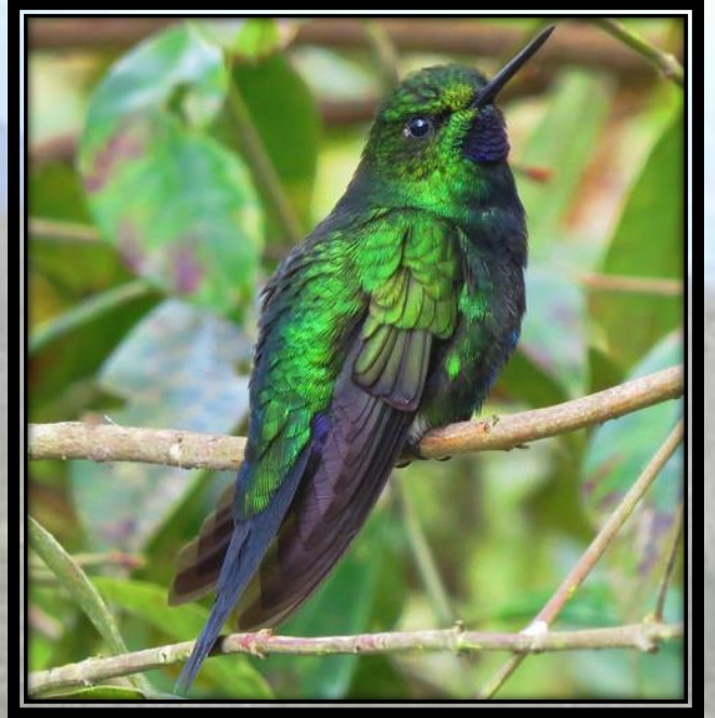
Hummingbird Glowing puffleg