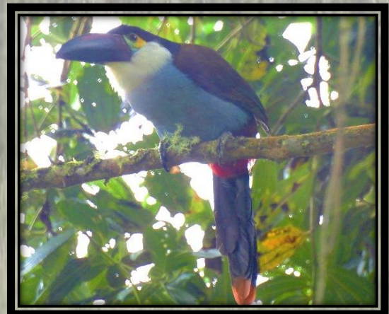
Black-billed Mountain Toucan

Other target birds: Andean Siskin, Black-headed Hemispingus, Rufous Antpitta, Noble Snipe, Black backed grosbeak, Rufous Browed Conebill, Eastern Meadowlark, White-chinned Thistletail, Scarlet-bellied Mountain-Tanager, Slaty-backed Chat-Tyrant, Plumbeous Sierra Finch, Black-billed Mountain Toucan and many more birds.