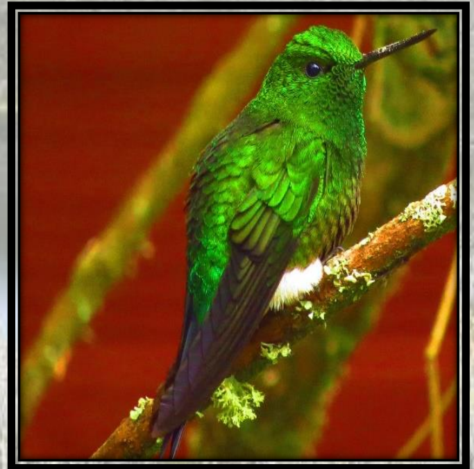
Coppery-bellied Puffleg

Other target birds: Blue-throated Starfrontlet ( Coeligena helianthea ), Coppery-bellied Puffleg ( Eriocnemis cupreiventris ), Sword-billed Hummingbird ( Ensifera ensifera ), Amethyst-throated Sunangel ( Heliangelus amethysticollis ), Speckled Hummingbird ( Adelomyia melanogenys ), Purple-backed Thornbill ( Ramphomicron microrhynchum ), Great Sapphirewing ( Pterophanes cyanopterus ), Mountain Velvetbreast ( Lafresnaya lafresnayi ), White-bellied woodstar ( Chaetocercus mulsant ), Tyrian metaltail ( Metallura tyrianthina ), Glowing Puffleg ( Eriocnemis vestita ), Colibri coruscans (Sparkling Violetear), Colibri cyanotus (Lesser Violetear) and many more birds!!!