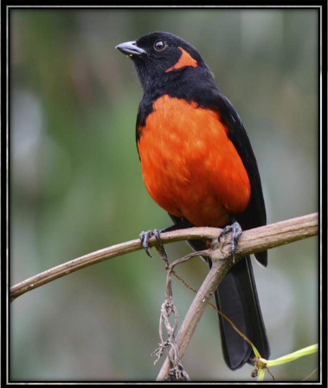
Scarlet-bellied Mountain-tanager