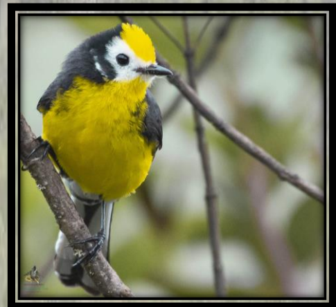
Golden-fronted Whitestart

Other target birds: Andean Siskin, Black-headed Hemispingus, Rufous Antpitta, Noble Snipe, Black backed grosbeak, Rufous Browed Conebill, Eastern Meadowlark, White-chinned Thistletail, Scarlet-bellied Mountain-Tanager, Slaty-backed Chat-Tyrant, Plumbeous Sierra Finch and many more birds.