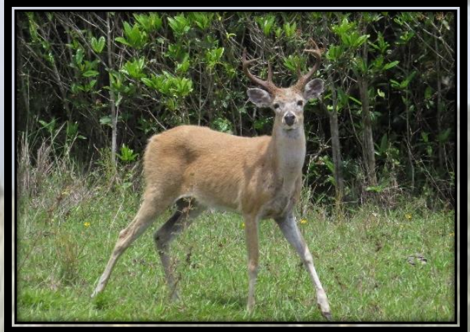
White-tailed Deer