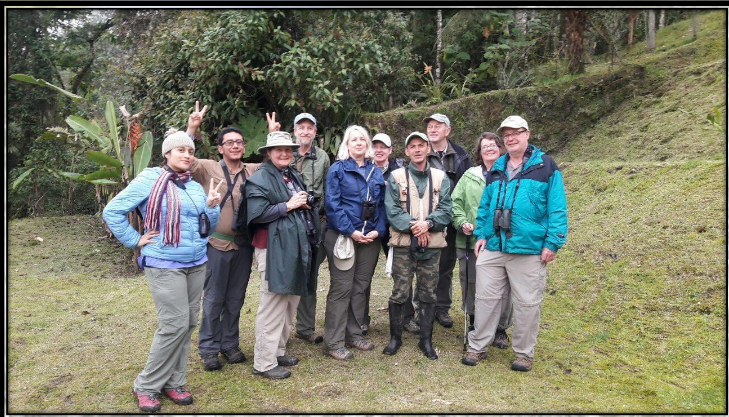
Birding tours

Colombia is the country with the big number of birds of the world with approximately 1921 species including endemic, near endemic, migratory and permanent residents. Colombia's wide variety of ecosystems and habitats make it a megadiverse country in fauna and flora.