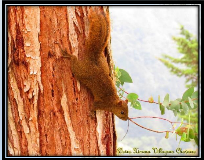
Red-tailed Squirrel