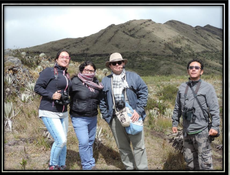
CHINGAZA NATIONAL PARK