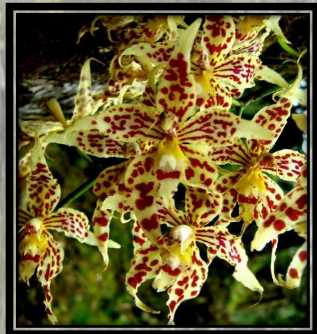
Glorious Odontoglossum – Endemic