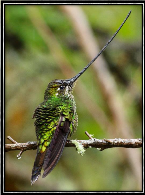
Sword-billed Hummingbird