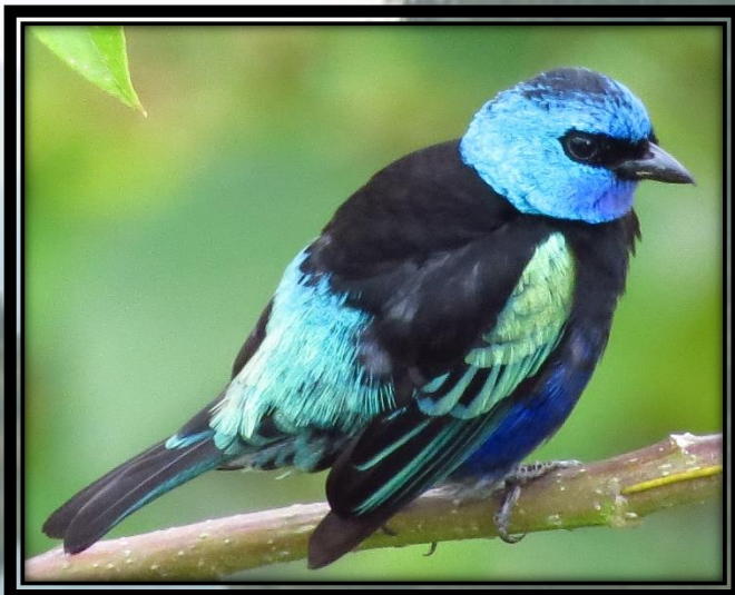
Blue-necked Tanager

We will have lunch in the area. Afterwards we will continue walking along the Pedro Palo Lagoon Nature Reserve to observe other target birds as Red-headed Barbet, Emerald Toucanet, Crimson-rumped Toucanet, Black-billed Mountain-Toucan, Channel-billed Toucan, Olivaceous Piculet, Acorn Woodpecker, Red-crowned Woodpecker, Smoky-brown Woodpecker, Red-rumped Woodpecker, Golden-olive Woodpecker, Crimson-mantled Woodpecker, Lineated Woodpecker, Olivaceous Woodcreeper, Olive-backed Woodcreeper, Brown-billed Scythebill, Streak-headed Woodcreeper, Montane Woodcreeper, White-throated Crake, Gray-cowled Wood-Rail, Sora, Spot-flanked Gallinule, Purple Gallinule, Common Gallinule, American Coot, Barred Forest-Falcon, Yellow-headed Caracara, American Kestrel, Bat Falcon, Peregrine Falcon, Chestnut-crowned Antpitta, Rufous Antpitta, Rusty-breasted Antpitta, Ash-colored Tapaculo, Blackish Tapaculo, Green-and-black Fruiteater, Andean Cock-of-the-rock, Yellow-headed Manakin, Barred Becard, White-winged Becard, Black-and-white Becard, White-breasted Wood-Wren, Velvet-fronted Euphonia, Thick-billed Euphonia, Golden-rumped Euphonia, Blue-naped Chlorophonia, Lesser Goldfinch and many more.