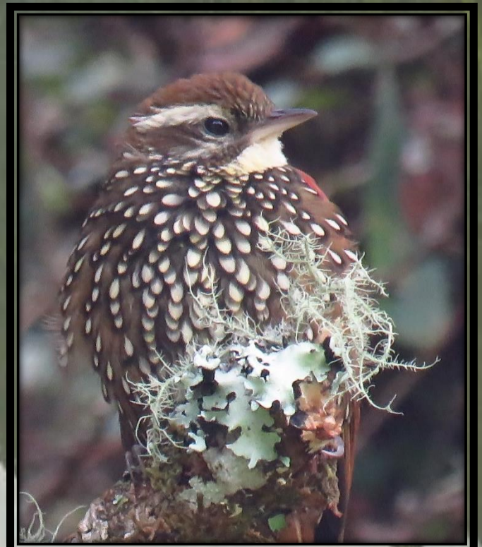
Pearled treerunner