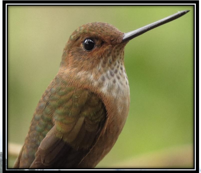
Bronzy Inca