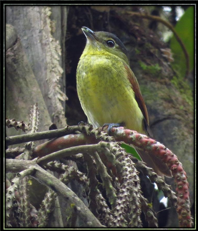
Barred becard