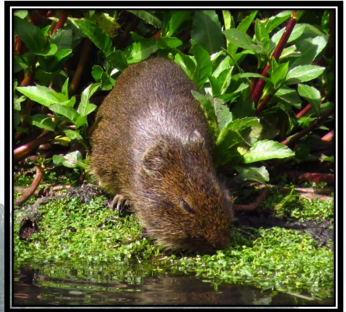
Guineas Pig