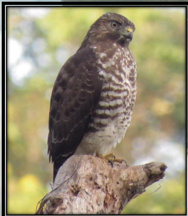
Broad-winged Hawk