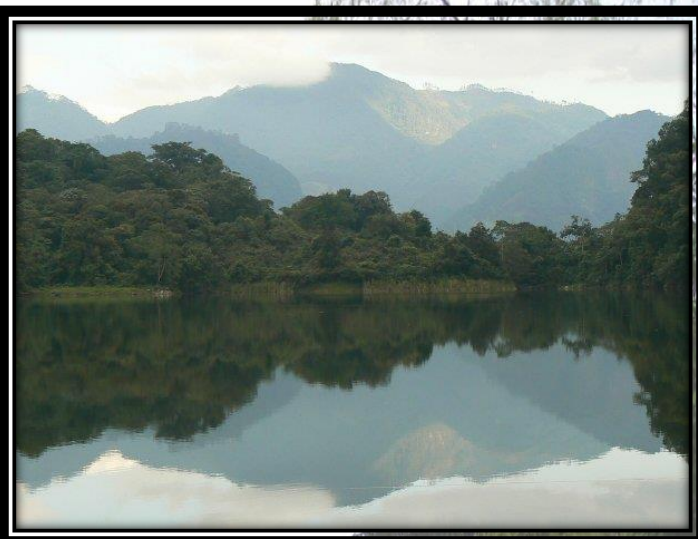
Birding in Laguna de Pedro Palo Nature Reserve

Endemic Birds: Black Inca, Turquoise Dacnis, Silvery-throated Spinetail, Indigo-capped Hummingbird