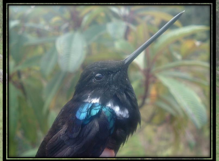
Endemic - Black inca