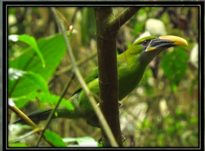
Emerald Toucanet