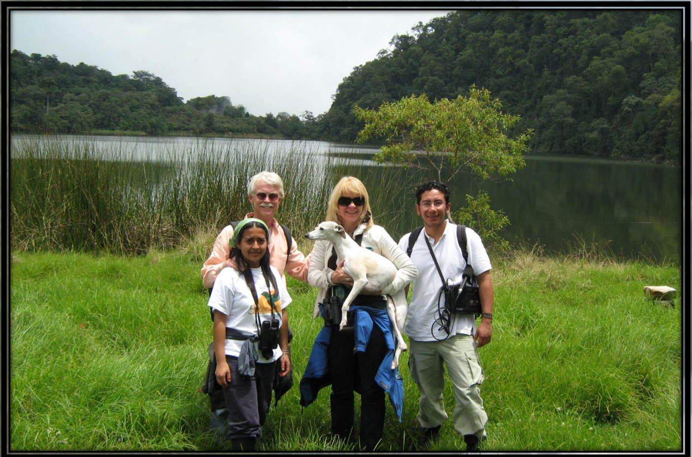
Birding tours

Colombia is the country with the big number of birds of the world with approximately 1921 species including endemic, near endemic, migratory and permanent residents. Colombia's wide variety of ecosystems and habitats make it a megadiverse country in fauna and flora.