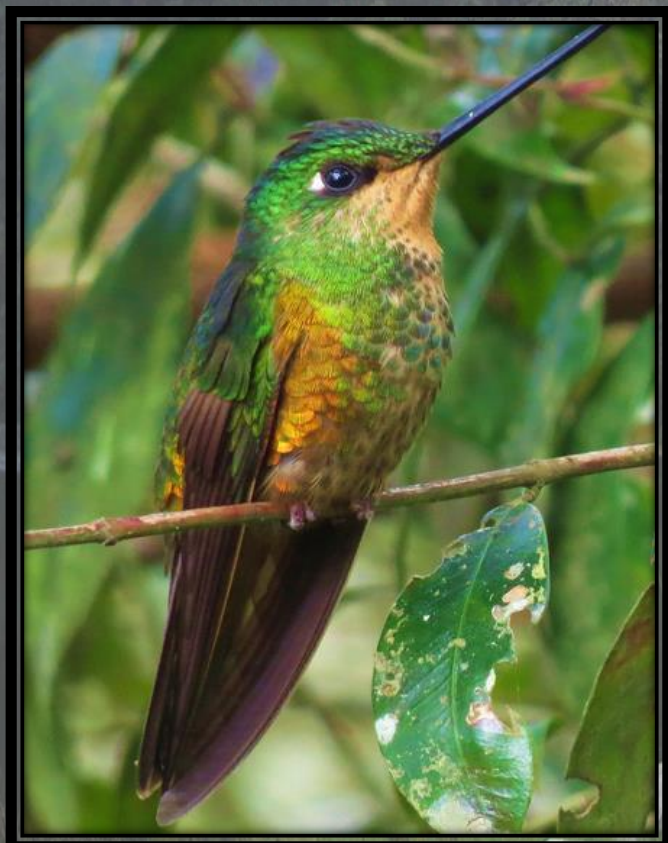
Golden bellied Starfrontlet

Other target birds: Is possible to observe inside Pedro Palo Lagoon Nature Reserve: Tropical Screech-Owl, Andean Pygmy-Owl, White-necked Jacobin, Green Hermit, Brown Violetear, Lesser Violetear, Sparkling Violetear, Purple-crowned Fairy, Black-throated Mango, Tourmaline Sunangel, Speckled Hummingbird, Long-tailed Sylph, Collared Inca, Mountain Velvetbreast, Great Sapphirewing, Booted Racket-tail, White-bellied Woodstar, Gorgeted Woodstar, Red-billed Emerald, Short-tailed Emerald, Great Tinamou, Colombian Chachalaca, Andean Guan, Sickle-winged Guan, Masked Trogon, Andean Motmot and many more birds!!!