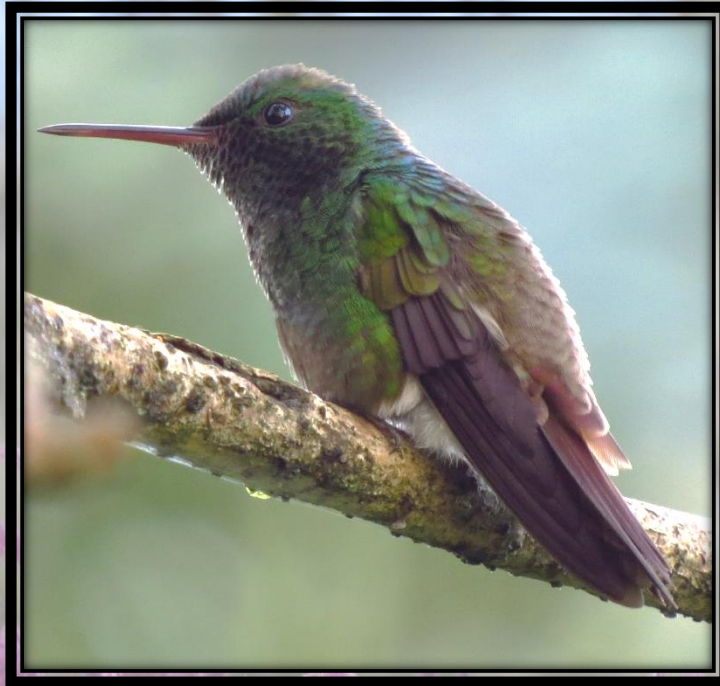
Green-bellied Hummingbird