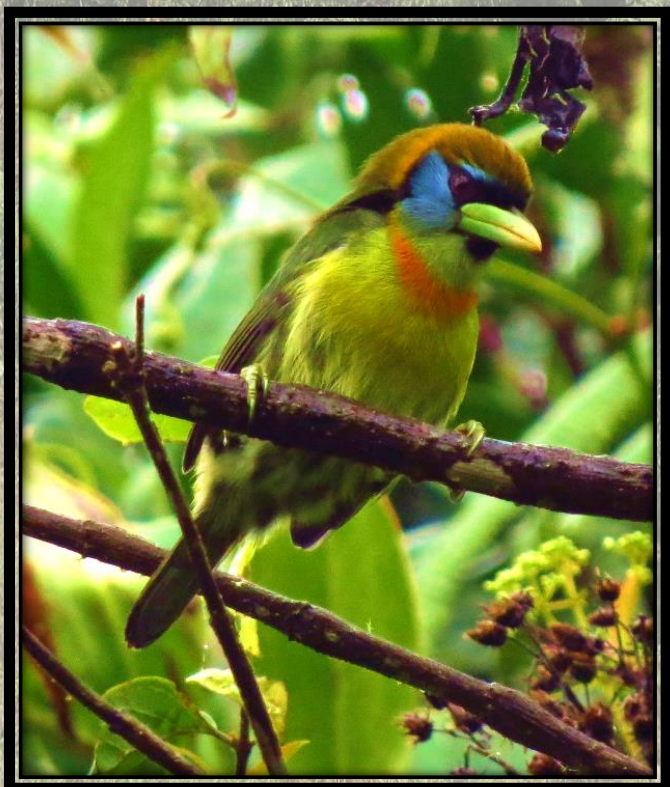
Red-headed Barbet