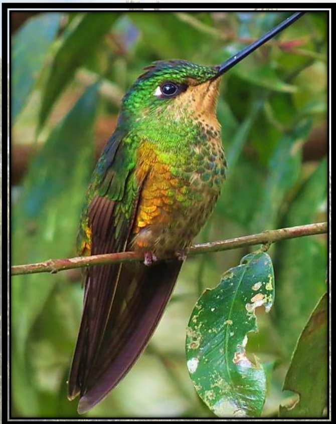
Golden Bellied Starfrontlet