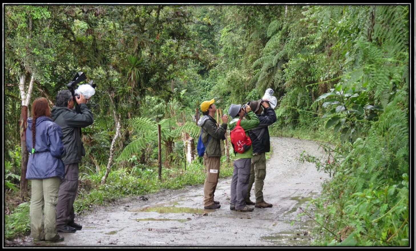
Birding in Monterredondo

Endemic birds: Cundinamarca Antpitta, Brown-breasted Parakeet, East Andean Antbird.