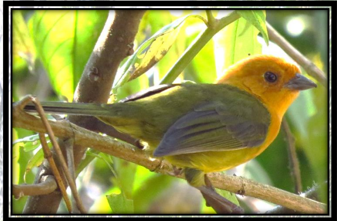
Ochre-breasted Brush Finch