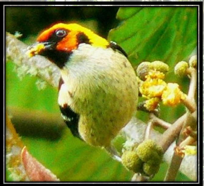
Flame Faced Tanager