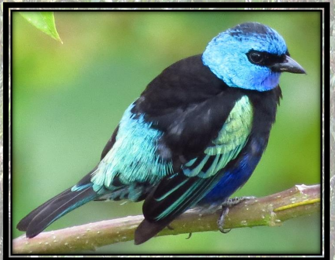
Blue-necked Tanager