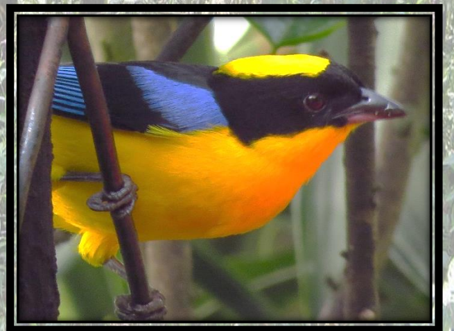
Blue-winged Mountain Tanager