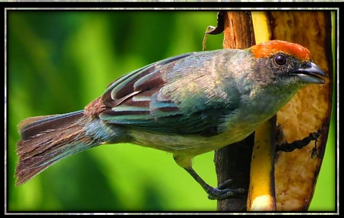
Scrub Tanager