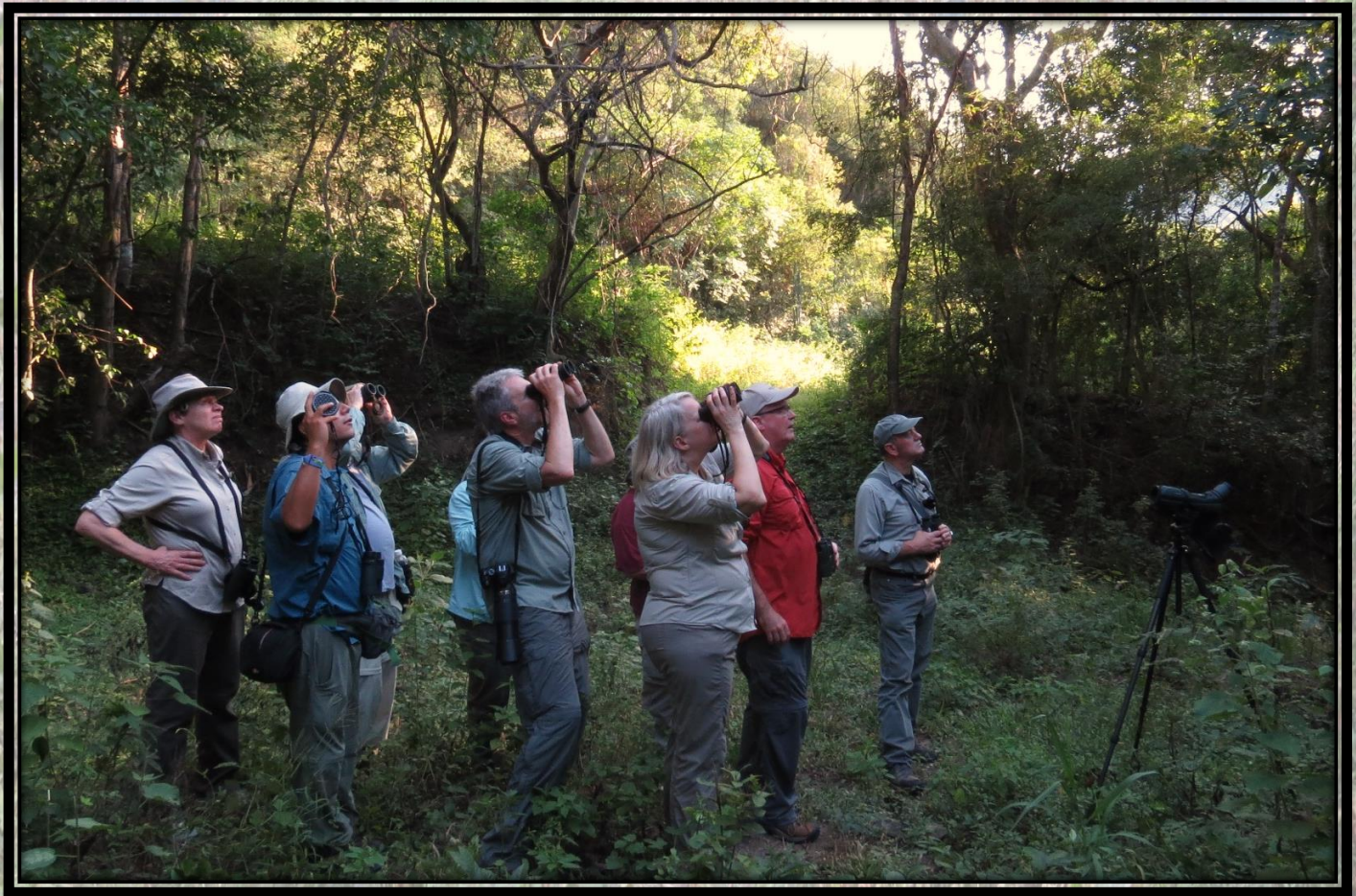
Birding tours

Colombia is the country with the big number of birds of the world with approximately 1921 species including endemic, near endemic, migratory and permanent residents. Colombia's wide variety of ecosystems and habitats make it a megadiverse country in fauna and flora.