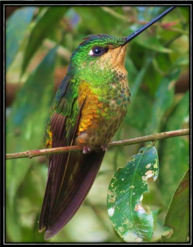
Golden bellied starfrontlet

Is possible to observe inside Chicaque Nature Reserve: Emerald Toucanet; lesser Violetear, Buff-tailed Coronet, Booted Racket-tail, Streak-necked Flycatcher, Rufous-crowned Tody-Tyrant, Golden-faced Tyrannulet, Azara's Spinetail, Ash-browed Spinetail, rufous Spinetail, Montane Foliage-gleaner, Streaked Xenops, Rufous-browed Peppershrike, Black-billed Peppershrike, rufous browed conebill, Brown-capped Vireo, Rufous-naped greenlet, Crimson-backed Tanager, Blue-grey Tanager, Palm Tanager, Blue-capped Tanager, Fawn-breasted Tanager, Golden Tanager, Flame-faced Tanager.