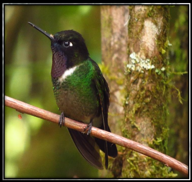
Amethyst-throated sunangel