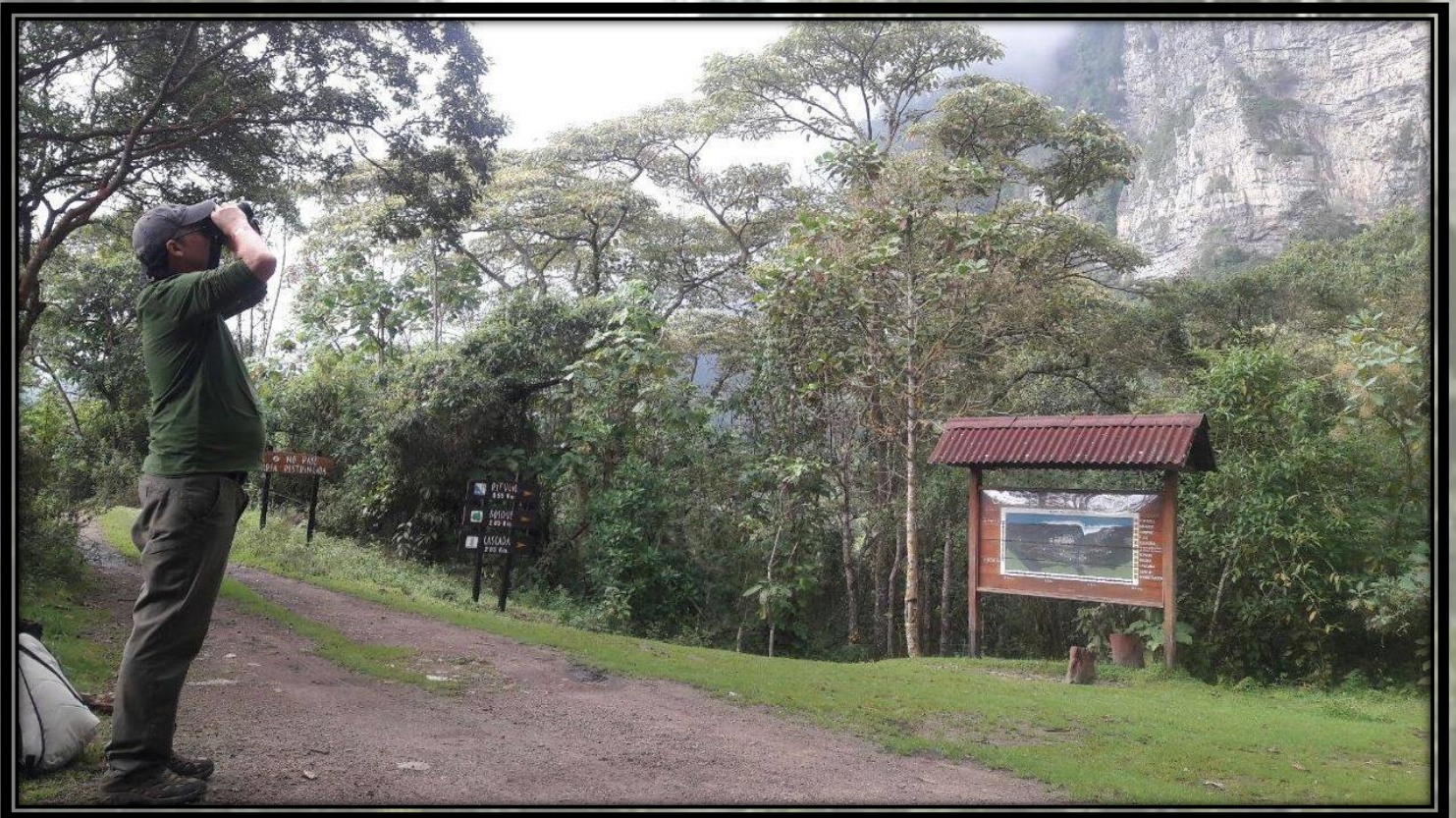
Birding tours

Colombia is the country with the big number of birds of the world with approximately 1921 species including endemic, near endemic, migratory and permanent residents. Colombia's wide variety of ecosystems and habitats make it a megadiverse country in fauna and flora.