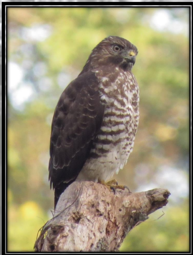
Broad-winged Hawk