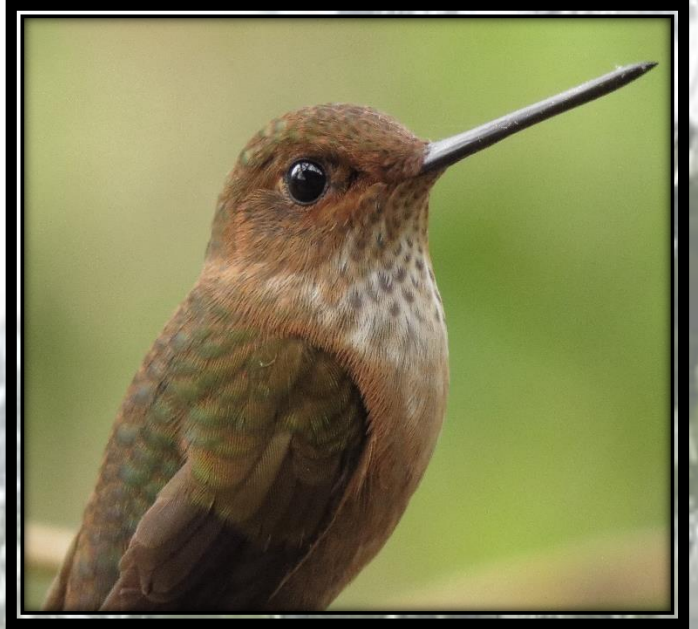
Bronzy Inca