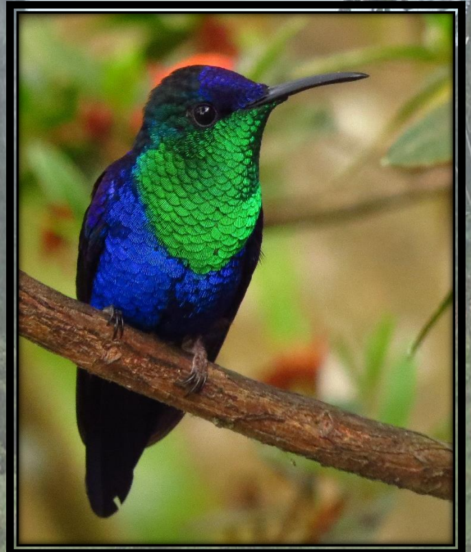
Crowned Woodnymph