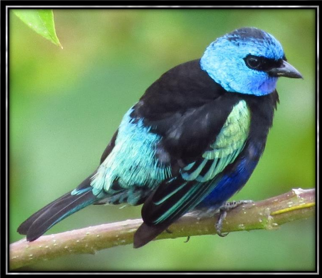
Blue-necked Tanager

We will have lunch in the restaurant of the Natural Reserve. Afterwards we will continue walking along the trails to observe other target birds as Golden-bellied Starfrontlet, blackish Tapaculo, Golden-fronted Whitestart, Rufous-breasted Flycatcher, Moustached Brush-Finch, Flavescens Flycatcher, Brown-billed Scytebill, Flame-faced Tanager, Smoky Bush-Tyrant, Grass-green Tanager, Andean Pygmy-Owl, Glowing Puffleg, Palen-naped Brush-Finch, Streak-capped Treehunter, Strong-billed Woodcreeper, hummingbird feeders and many more.