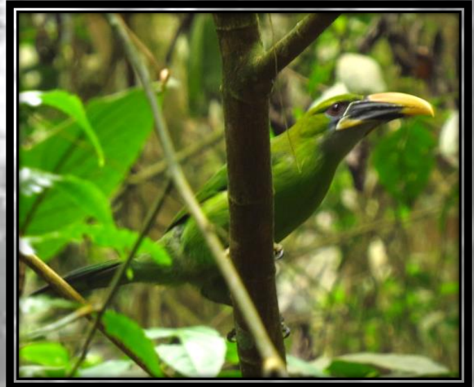
Emerald Toucanet