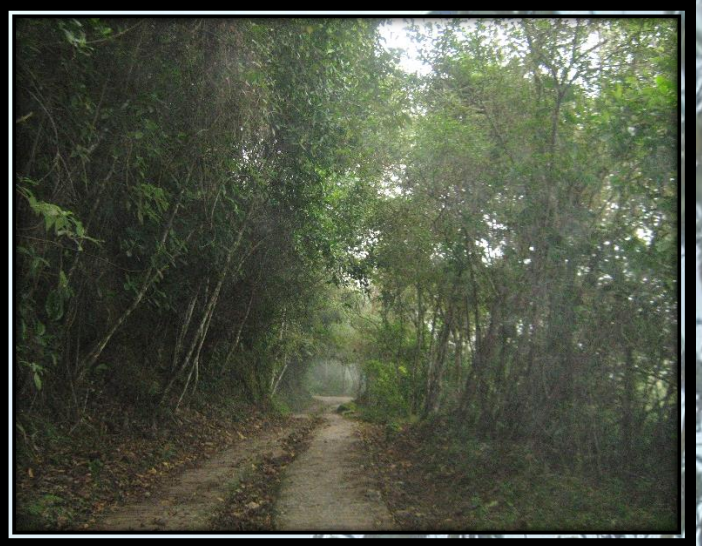
Birding in Chicaque Nature Reserve

Is possible to observe inside Chicaque Nature Reserve: Emerald Toucanet; lesser Violetear, Buff-tailed Coronet, Booted Racket-tail, Streak-necked Flycatcher, Rufous-crowned Tody-Tyrant, Golden-faced Tyrannulet, Azara's Spinetail, Ash-browed Spinetail, rufous Spinetail, Montane Foliage-gleaner, Streaked Xenops, Rufous-browed Peppershrike, Black-billed Peppershrike, rufous browed conebill, Brown-capped Vireo, Rufous-naped greenlet, Crimson-backed Tanager, Blue-grey Tanager, Palm Tanager, Blue-capped Tanager, Fawn-breasted Tanager, Golden Tanager, Flame-faced Tanager.